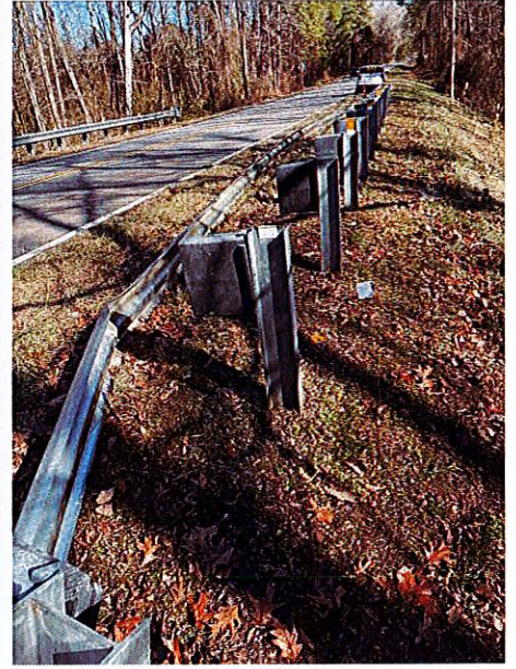
Pictures of guardrail damage ( Vendors are requested to visit project site before submitting quote ).