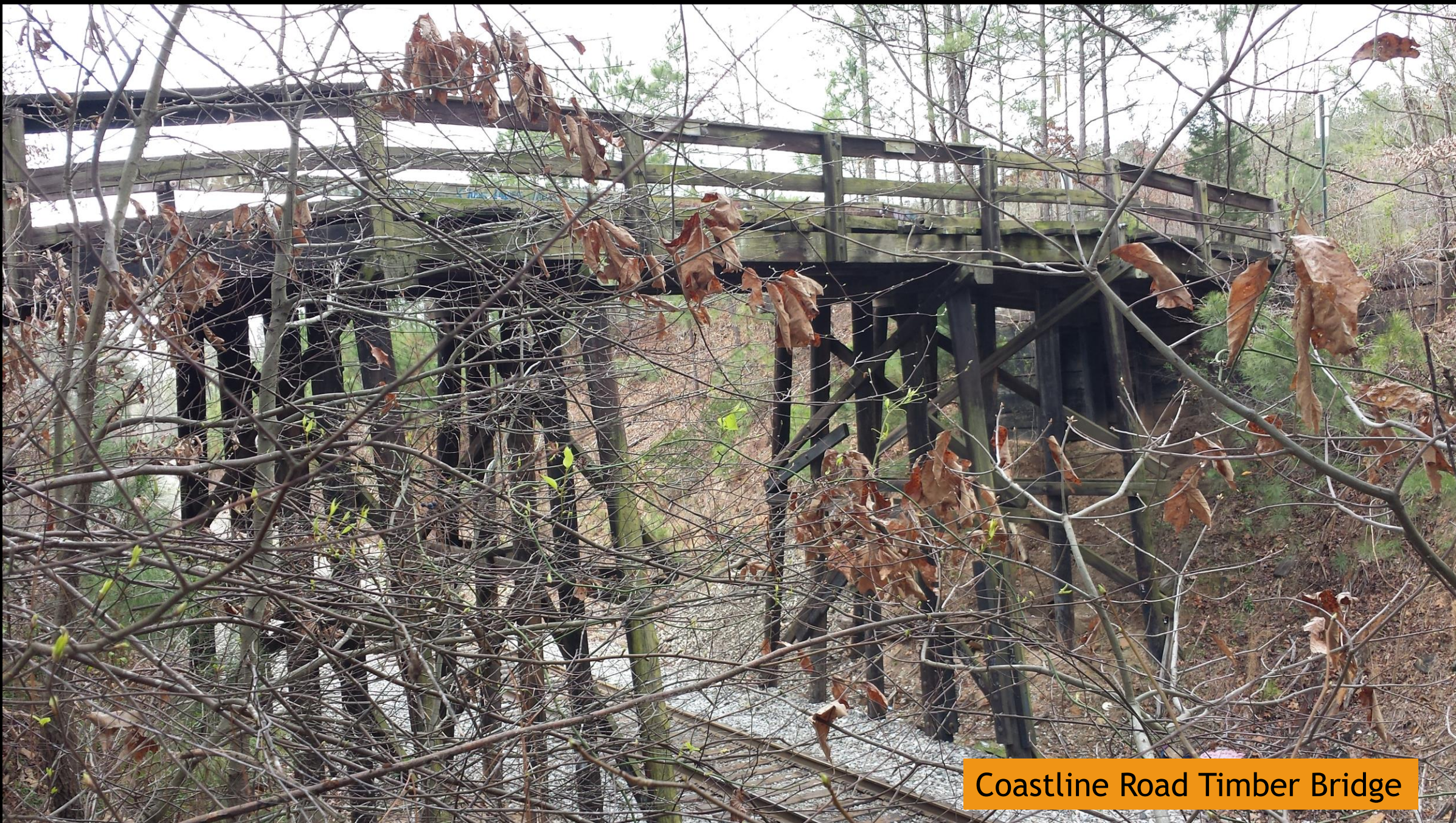
Coastline Road Timber Bridge