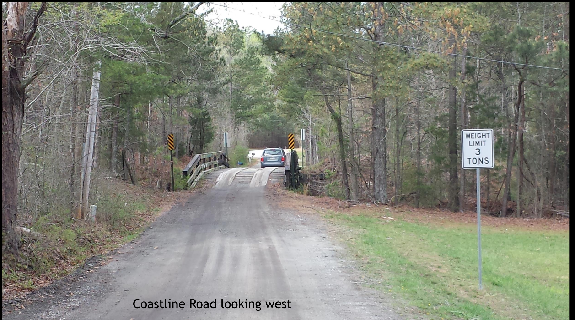
Coastline Road looking west