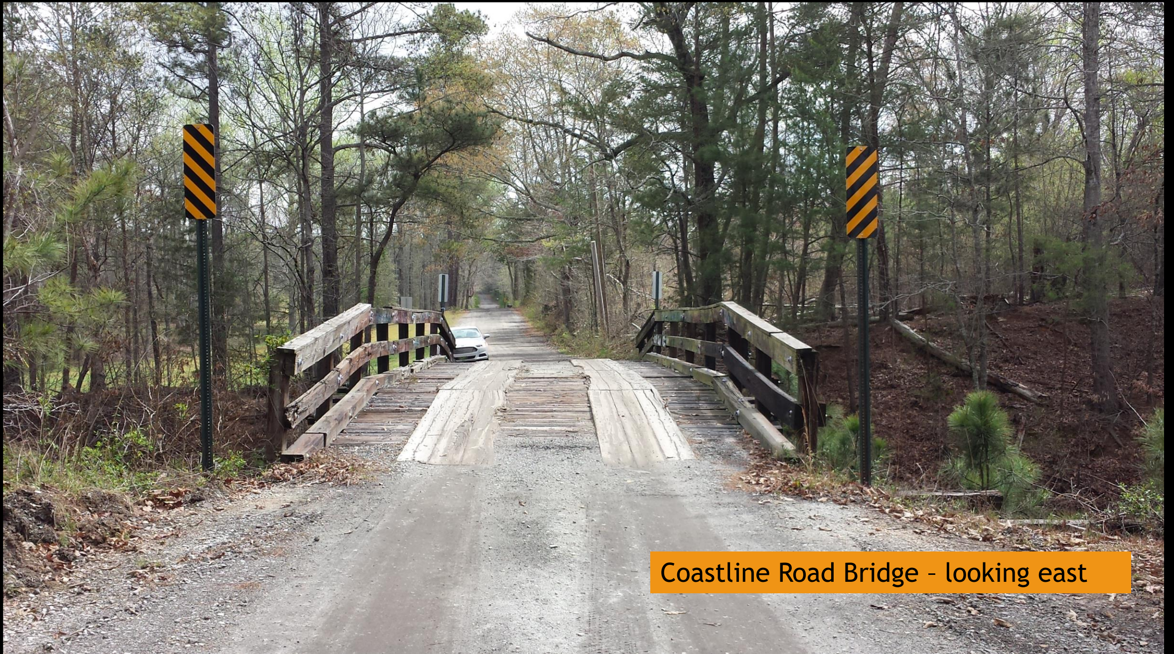
Coastline Road Bridge - looking east